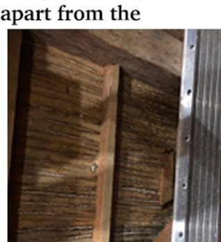
Photo of lath after completed re-attachment. Note the holes in lath through which consolidant has been injected.

Tony and his assistant Chris work on both sides of the ceiling. First, from the attic, they paint every visible bit of plaster with a dilute "consolidant" (a type of glue) to keep it from crumbling. Next, from below, and working 22 feet above the floor of the sanctuary, they gently push loose plaster back up in place, against the lath. Then, back in the attic, they bore holes in the lath through to the back of the plaster. They inject a thicker consolidant through these holes to re-connect plaster and lath. Finally, still in the attic, they apply thick consolidant to the top of original plaster keys.