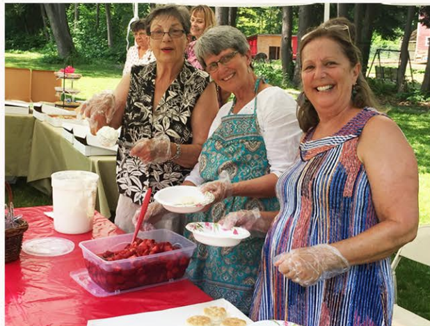
Plenty of berries and whipped cream!