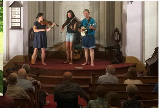
The Gawler Family, 2019